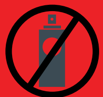
Fixatives and Preservatives